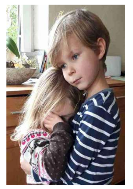
Fig. 3: Siblings quarrel most of the time. To comfort the little sister requires empathy in another person's suffering.

and interpersonal social interaction related on mirror neurons.