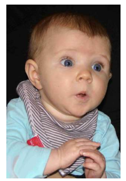
Fig. 1 : Shortly after birth, toddlers have a wide range of feelings.

These case reports suggest that dysfunction of mirror neurons may be associated with psychopathological disorders. A typical mental disturbance is the antisocial personality disorder. Among other things, the DSM-V describes symptoms as: ego-centrism, goals are pursued only on the basis of own interests, not because of prosocial behavior (e.g. with violations of laws), lack of understanding for the feelings, needs and suffering of other people, lack of empathy, when others are hurt, problems with intimate partnerships that are exploited for one's own purposes without addressing the needs of the partner; and dominant behavior to control others.