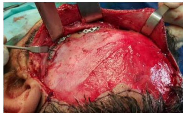
Figure4 : Coronal typ4 fracture exposure and mini plate contention.

The fixation of the fracture was achieved by mini plates (2cases), which allowed a fast anatomic and functional reconstruction (Fig4) [18]. As for the use of the fixation by steel wire, it keeps a place in comminutive fractures, 1cases of ourseries.