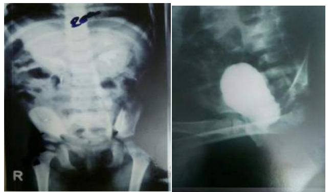
Fig 12)IVU(postoperative)after marsupilazation+Rt heminephroureterectomy: Normal urogram

Fig 13) MCUG(postoperative) after marsupilazation+Rt heminephroureterectomy: refluxing megaureter corrected