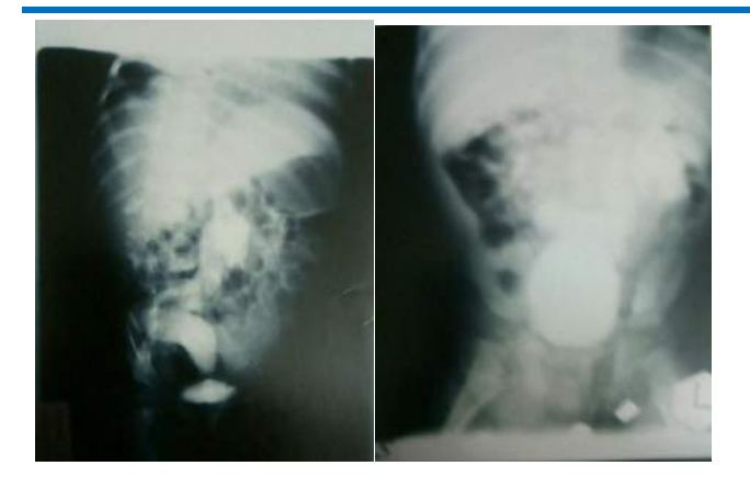
Fig 1) IVU: Primary Lt. refluxing megaureter Fig2) IVU: Primary refluxing megaureter in infant