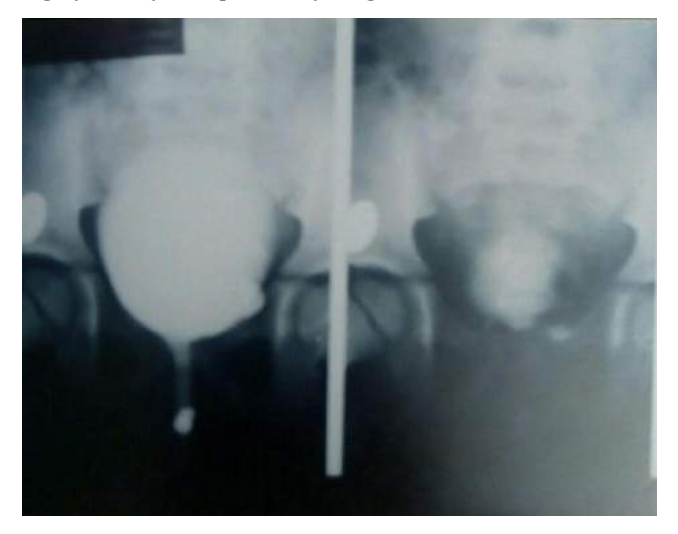
Fig 5) MCUG (postoperative): Reflux corrected after tapering and reimplantation

Four other cases with primary obstructed megaureter (adynamic segment, stenosis, ureterocoele) were treated with reimplantation and tapering of ureter. One of the two cases of ureterocoele was a complicated case (18-year old girl was diagnosed 10 years before as a case of VUR in one moiety of duplicated ureter and