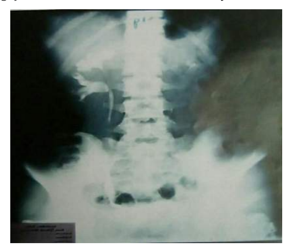
Fig 8) IVU (postoperative) after tapering and reimplantation: Normal urogram

Fig 6) KUB: Stone in Rt. Ureterocoele+kidney Fig7) IVU :Rt. Ureterocoele with secondary stone