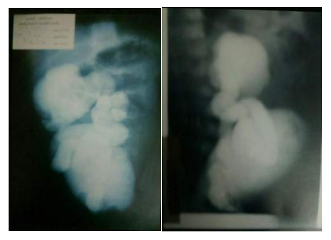
Fig 11)MCUG after marsupialization of ureterocoele:-Rt megaureter+severe hydronephrosis

Fig 9)IVU Lt obstructive megaureter +Rt. ureterocoele Fig 10)IVU: Film after 5 hours obstructed MGU