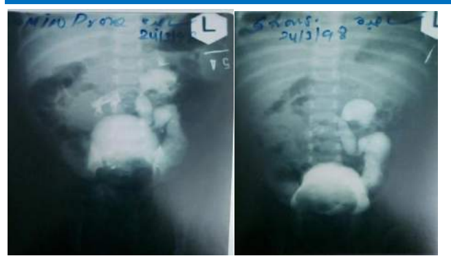
Fig 9)IVU Lt obstructive megaureter +Rt. ureterocoele Fig 10)IVU: Film after 5 hours obstructed MGU