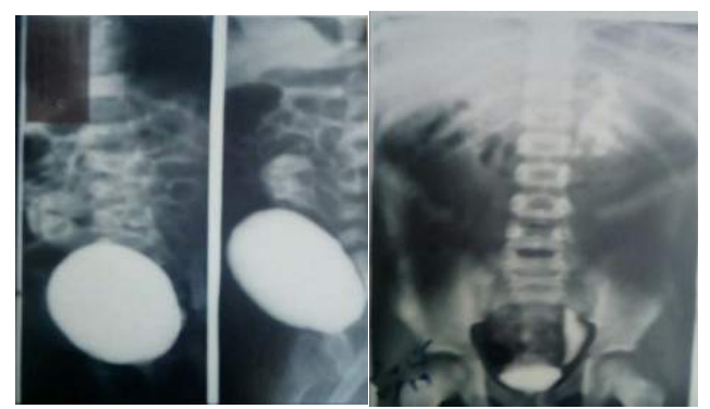
Fig 3) MCUG: Lt. Refluxing megaureter Fig 4) IVU :(Postoperative) Megaureter corrected

Fig 1) IVU: Primary Lt. refluxing megaureter Fig2) IVU: Primary refluxing megaureter in infant